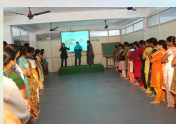
21st December 2010, Hyderabad, Andhra Pradesh