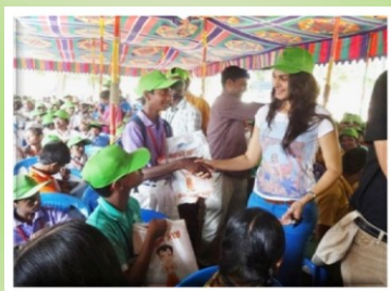
450 deaf persons from seven deaf schools

28 th February 2014, Chennai, Tamil Nadu