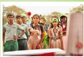
600 deaf persons from seven deaf schools

1 st March 2014, Hyderabad, Andhra Pradesh