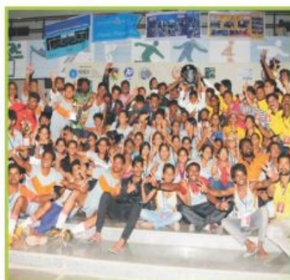
Winner - Kerala