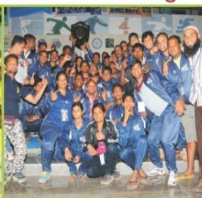
Runner - up - Maharashtra