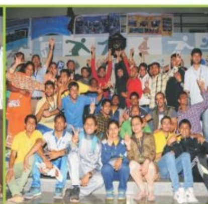
Third Place - Haryana