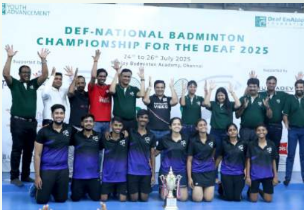
In the team category, the Hyderabad players put up a great fight and clinched the winners trophy.