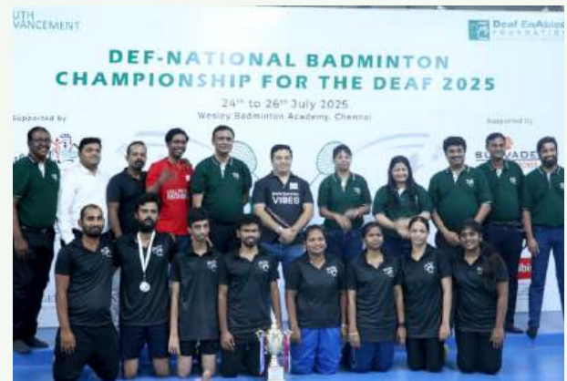
While the Vijayawada team secured the runners' trophy by losing just by a small margin.