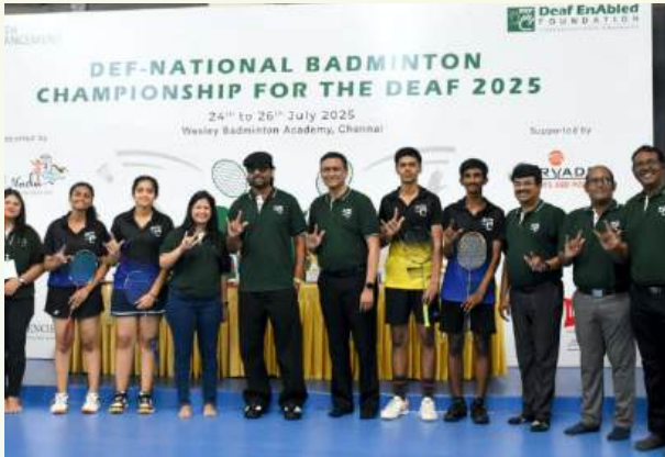
Mr. Murali Vijay, former ace Indian International Cricketer, graced the occasion as the Chief Guest in the final showdown for the championship trophy.